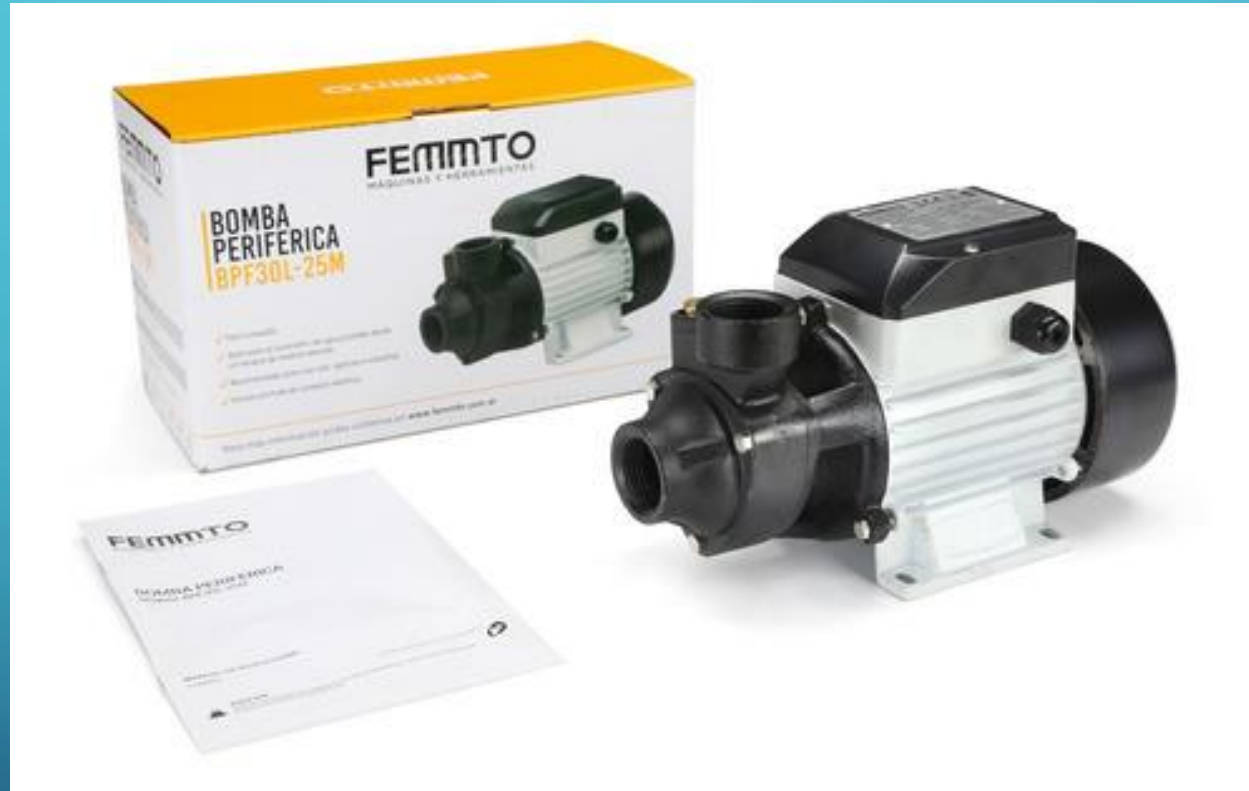
0.50 HP water pump